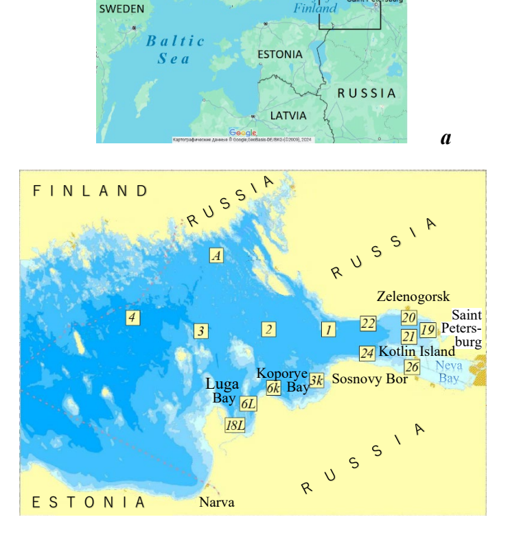
Fig. 1. Gulf of Finland (the rectangular on the map shows the study area in the eastern part of the Gulf) (a) and an enlarged image of the selected area with a sampling station grid (b) [3, 10]. Google Maps image (available at: https://www.google.ru/maps)

In 2020, two cruises were carried out as part of the monitoring studies: in June and September. The cruises were carried out according to the VNIRO state assignment No. 076-00005-20-02. Samples were collected at 15 stations during the cruises (Fig. 1, b ).